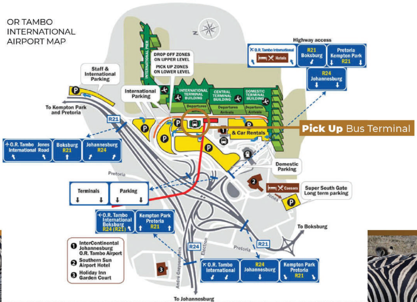
OR TAMBO INTERNATIONAL AIRPORT MAP

GARDEN COURT OR Tambo Airport 011 974 5202 3Km Max - Uber/Taxi